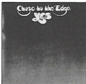
CLOSE TO THE EDGE