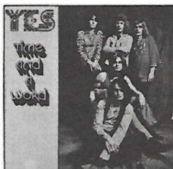
TIME AND A WORD