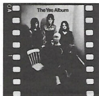
THE YES ALBUM