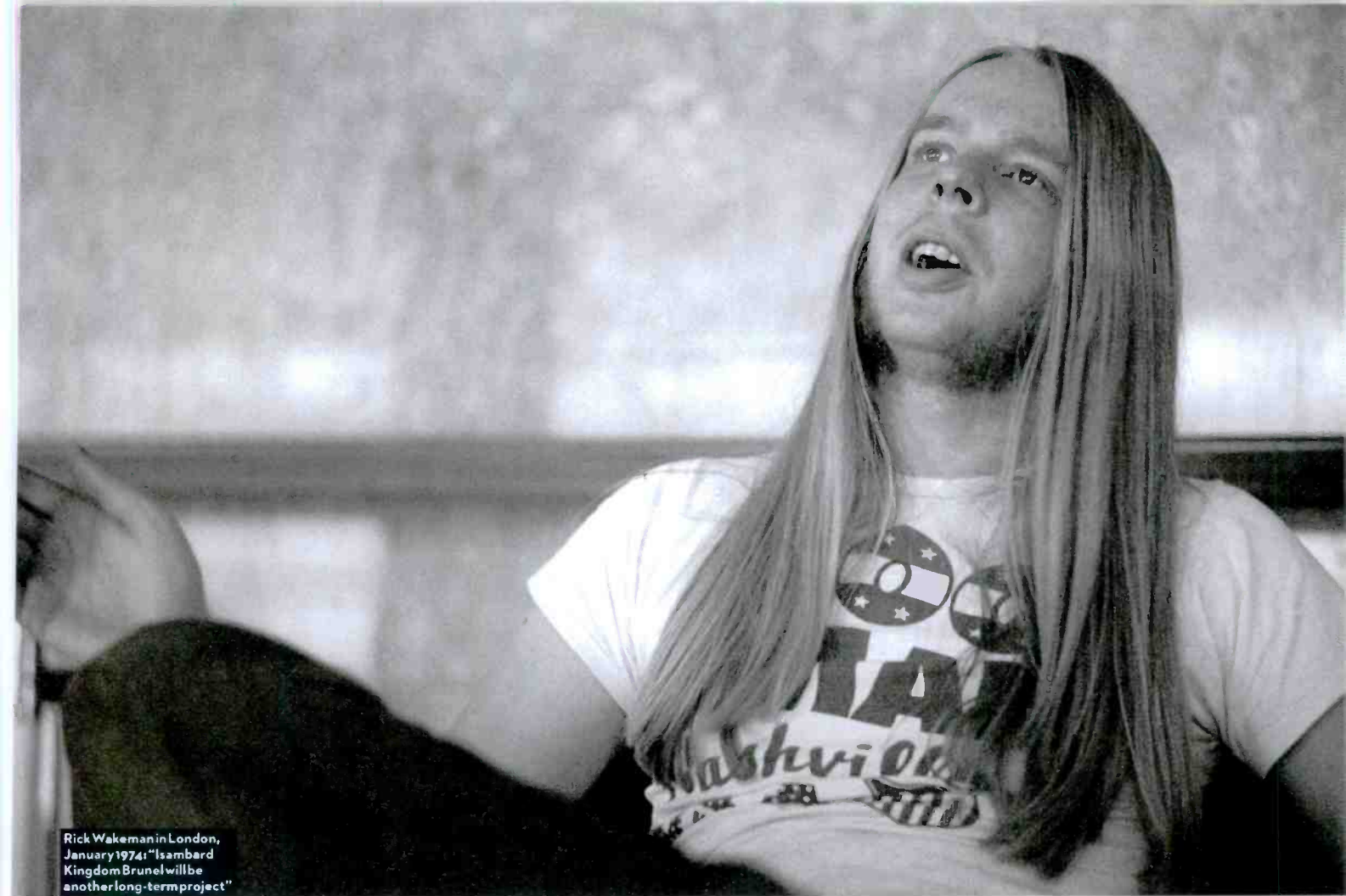
Rick Wakeman in London, January 1974: "Isambard Kingdom Brunel will be another long-term project"